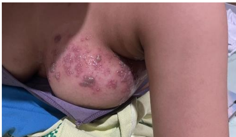
Figure 2. Ventral view, on the left chest, small vesicles clustered in multiple round shapes measuring 0.3-0.5 cm above the erythematous skin, unilateral, not crossing the midline (picture of the first day of treatment)