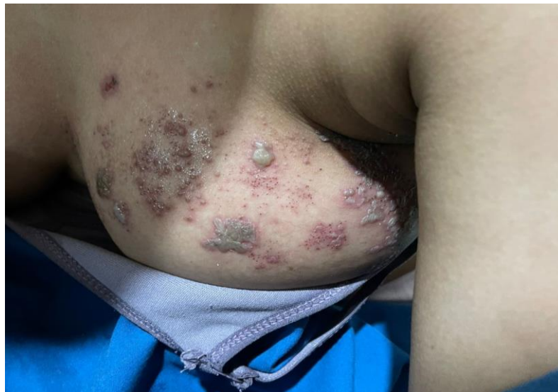
Figure 4. Ventral view. Lesions after the fourth day of treatment