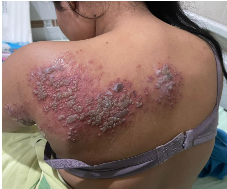
Figure 1. Dorsal view. On the upper left back at the level of T2-T6, small vesicles clustered in multiple round shapes measuring 0.3-0.5 cm above the erythematous skin, unilateral, not crossing the midline (picture of the first day of treatment)

Investigations supporting herpes zoster in this case, such as antigen/nucleic acid identification examination using the PCR method and the Tzank test in the vesicle eruption phase, were not carried out because the results of the anamnesis and physical examination, including UKK and Predilection, were sufficient to confirm the diagnosis of Herpes Zoster. ( Leung et al., 2022 ).