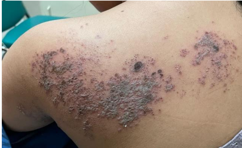
Figure 3. Dorsal view. Lesions after treatment day 4

Pharmacological therapy for herpes zoster is acyclovir 4x800 mg per day taken orally for five days, triamcinolone 4 mg/day, NaCl compresses 15 minutes 2x a day, calamine lotion 2x a day on intact lesions and mupirocin calcium on open wounds. The patient was recommended for hospitalisation to facilitate treatment and to observe complications of herpes zoster in the form of dermatovenerological neuralgia and joint treatment with a neurologist. In integrated treatment, the patient also received gabapentin 300 mg/day for four weeks, paracetamol 3x500 mg/day and methylprednisolone injection 125 mg/8 hours, as well as changing oral acyclovir to IV acyclovir 20 mg/kg BW/day four times a day for five days. Acyclovir is dissolved in 100 cc of 0.9% NaCl and given within 1 hour.